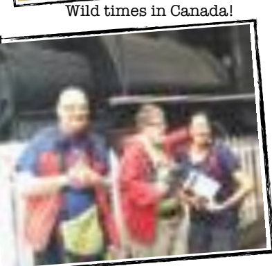
Visiting the train museum