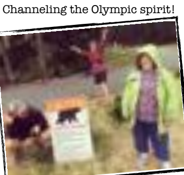
Uh-oh! Four Monkeys!